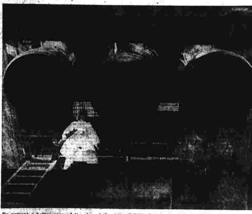
To present a better view of the size of the Atlas ICBM, this photo shows the business end of the free world's most powerful ether rocket engines, the propulsion system of the Atlas. The primary units are composed of twin-lander boosters, left and right, a sustainer in the center, and a nose cone, right, being inspected by a Rocketdyne Field Service representative, right.

Washington, Dec. 19 (AP)—U.S. rocketmen hurled a 4-ton satellite into orbit around the Earth last night in a giant stride toward outer space and man's mastery there. The feat, dramatically announced by President Eisenhower at a White House diplomatic dinner, gave this country the biggest known man-made object now swinging around the planet. The new Pullman car-size satellite (weighing 2,319 pounds) of Russia's Sputnik III launched last May 15. It comes close to, or surpasses the bulk of the Soviet carrier rocket which went separately into orbit but plunged to its death Dec. 7.